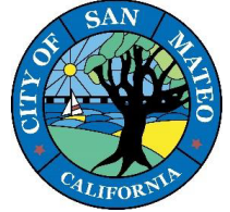
Sample of Photo